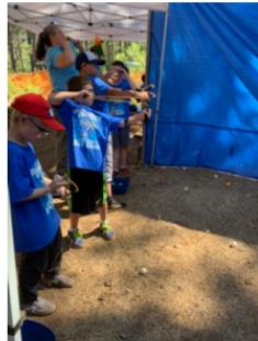
Day Camp at Sly Park